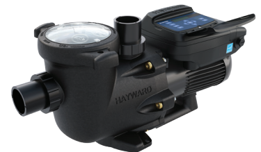
TRISTAR® VS 950