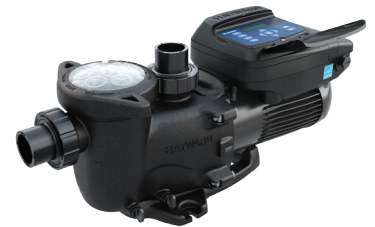
MAXFLO VS® 500